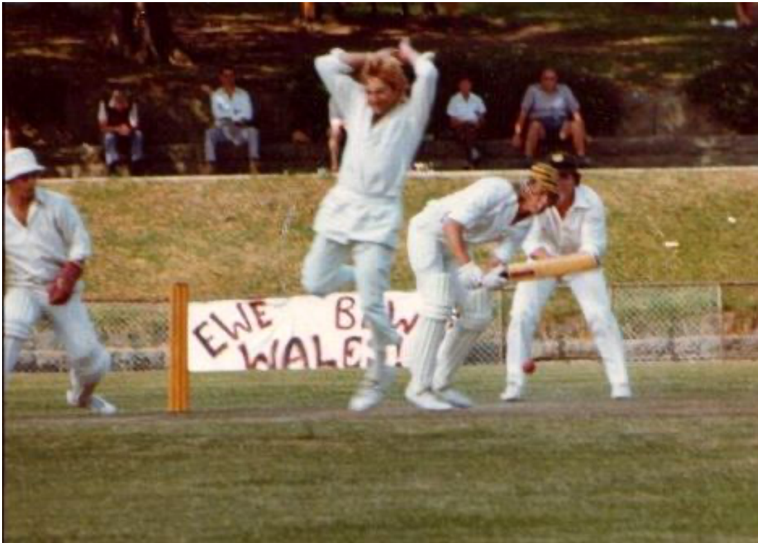
Final V Petersham 1976-77