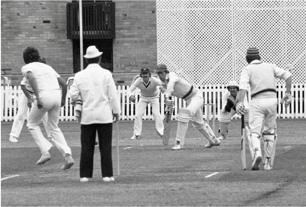
1981 Batting v Penrith