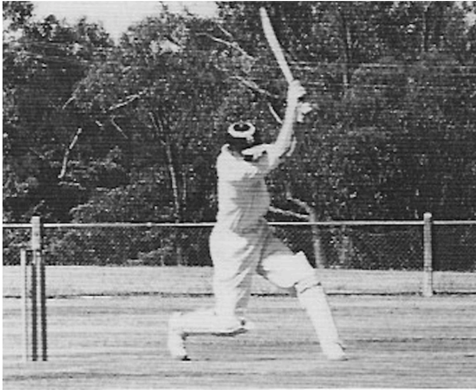
No. 9 Batsman doing what he likes best