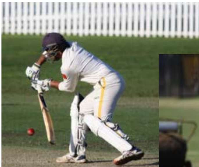
Some 5 th Graders in action vs. Sydney University...