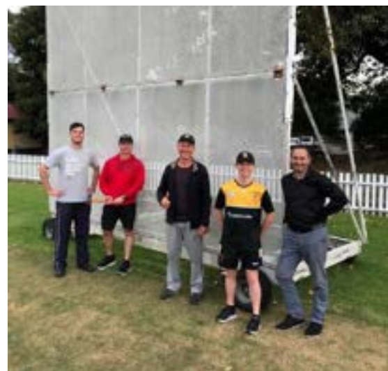
MIDDLE LEFT: “Royal” Alexandria Park.