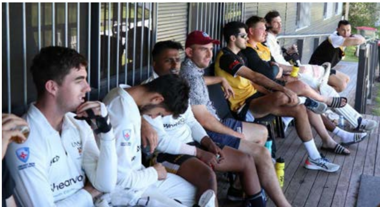
ABOVE: 2 nd Grade (as well as a few others...) look on from the DP Pavillion deck vs. Penrith....

If you asked me how I would sum up 2022/2023 it would be replied with one powerful phrase; 'unfulfilled'. Off the back of a well-improved season in 2021/2022, second grade looked stronger, more equipped, and more capable of being a true contender for finals cricket. Second grade is tough - with every game this season either going down to the wire or only winning by the barest of margins. Tight games and stress points age a team quickly and if I put one finger on the pitfall of our season it was sheer tiredness.